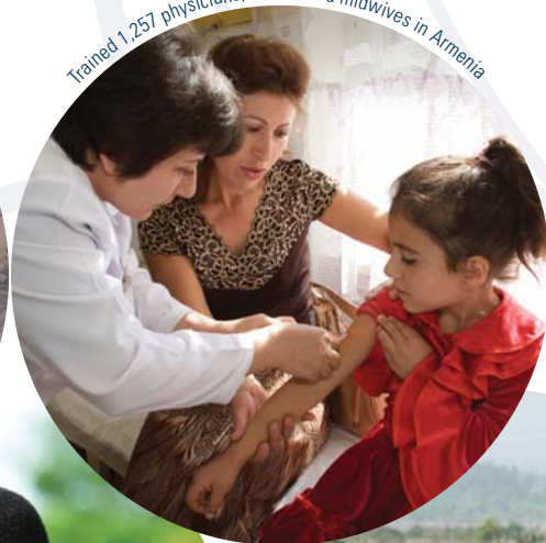
Trained 1,257 physicians, nurses and midwives in Armenia