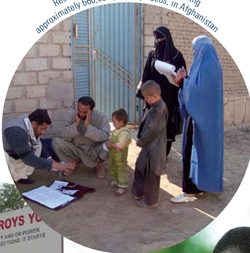
Restored 6.5 million documents, including approximately 666,800 property deeds, in Afghanistan