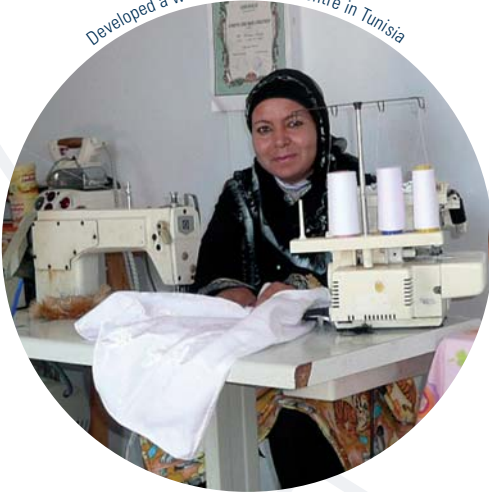
Developed a women's training centre in Tunisia