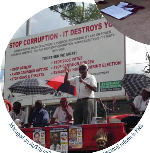
Managed an AUS$16 million trust fund to support electoral reform in PNG