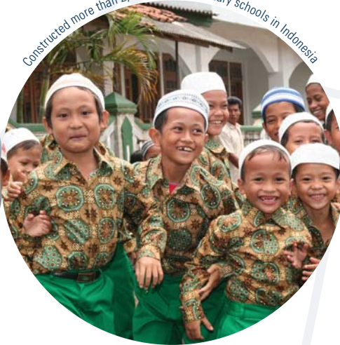
Constructed more than 2,000 junior secondary schools in Indonesia